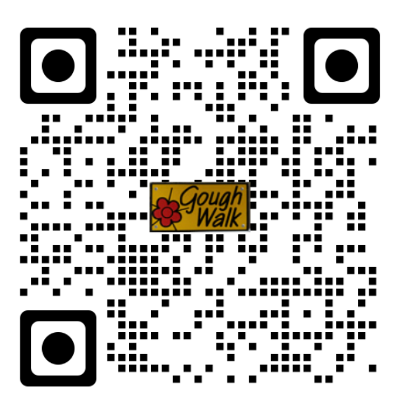
Gough Walk 2