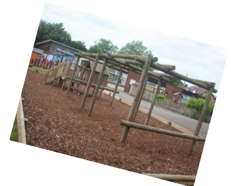
Adventure Play Area