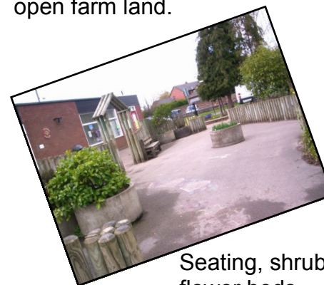
Seating, shrub and flower beds