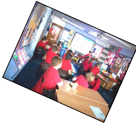
One of our Classrooms