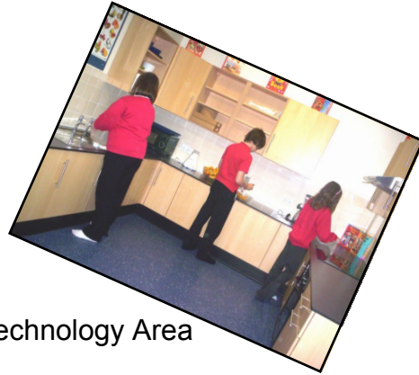
Food Technology Area