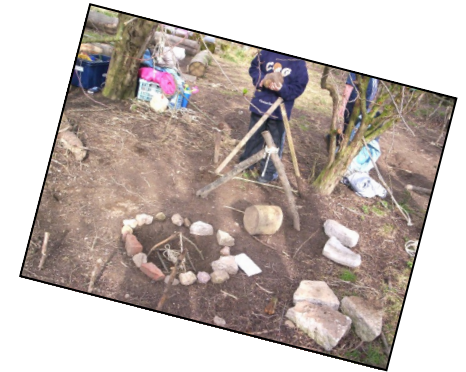
Wildlife Forest School area.

There is a landscaped hard-surfaced playground which includes large playing field beyond which is open farm land.