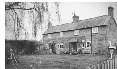
1 Leaton Corner, our NEW holiday cottage

RESIDENTIAL RURAL COTTAGES & HOUSES TO LET