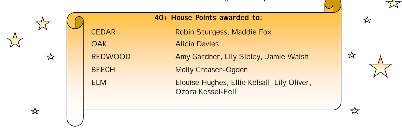
KEEP WORKING, CAN THE OTHER HOUSES CATCH UP WITH ELM?

Photographs of individual students who have achieved some of the aforementioned rewards are also on display. Congratulations to MADDIE FOX 8C who has been awarded the most house points to date (48 in total) and to all those students who have each received a £5 voucher for accruing 40 house points.