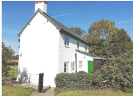
Albion Hayes Our Holiday Cottage and Residential Rural Cottages to let near Shrewsbury and Bomere Heath