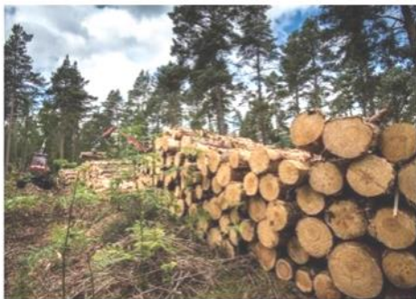
Firewood, Kindling and Logs