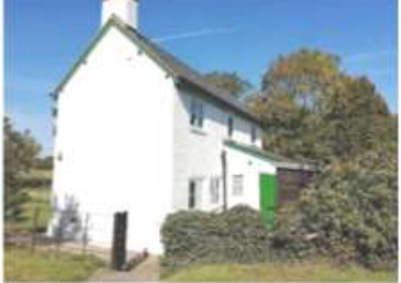
Albion Hayes Our Holiday Cottage and Residential Rural Cottages to let near Shrewsbury and Bornere Heath